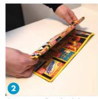
Flatten your cardboard and plastic bottles. This will free up space in your