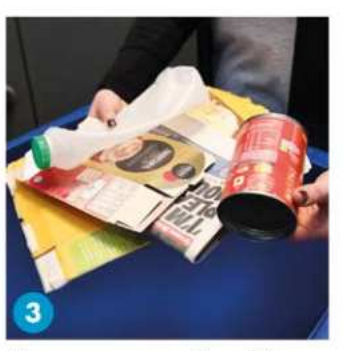
Place your paper, cardboard, tins, cans and plastic bottles into your blue bin. All items should be loose.