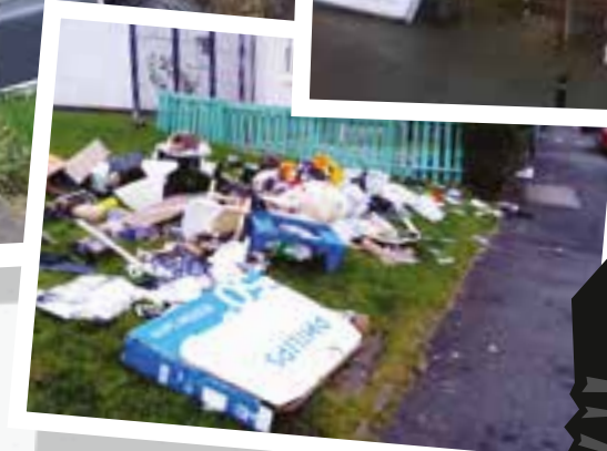
Garvel Road (on Garvel Crescent Site)